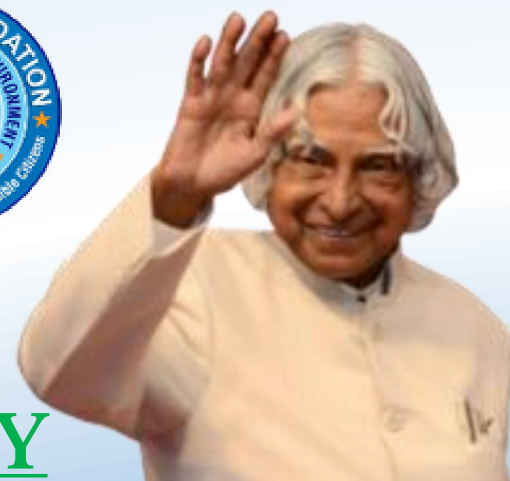
Inspired by Dr. APJ Abdul Kalam 11th President of India Chief Mentor Lead India Movement